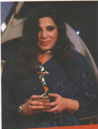
Woman Lawyer Of The Year